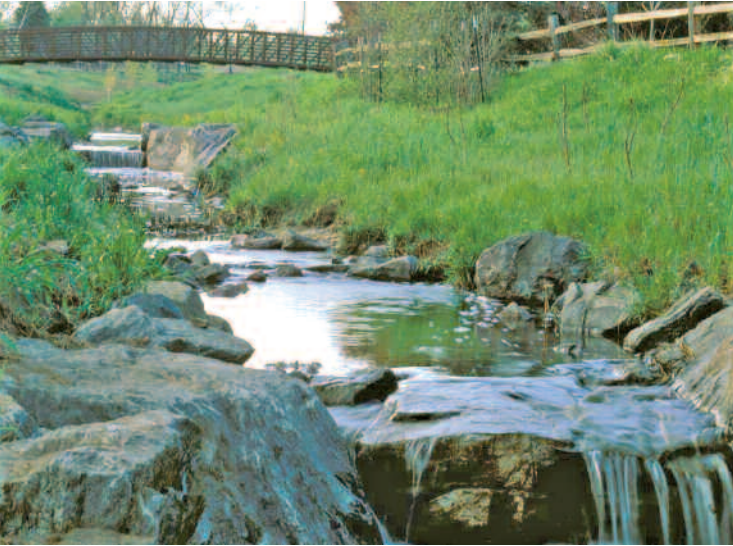
Greenwood Gulch between Holly and Orchard Road